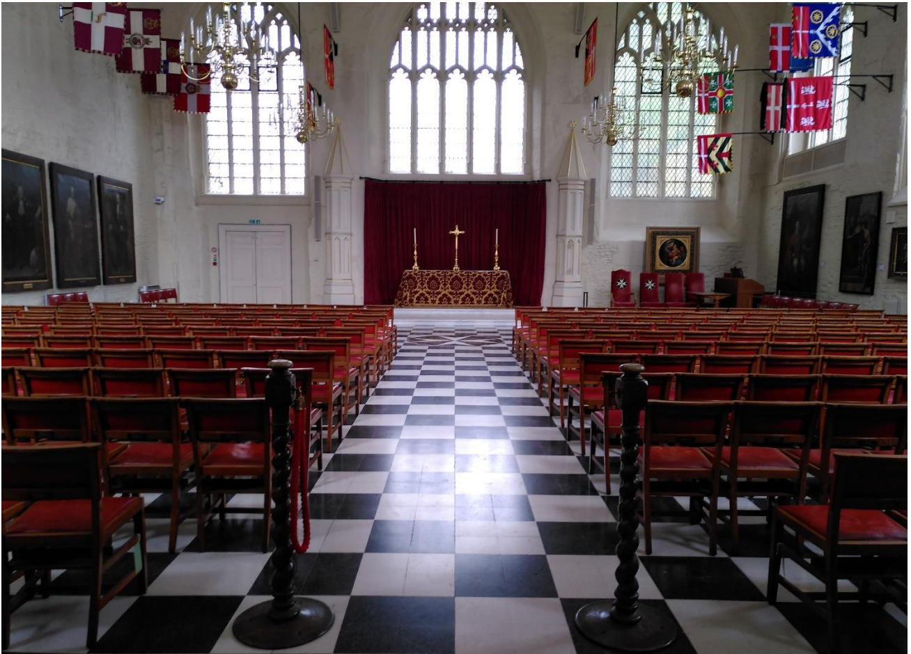
The interior of the Priory Church.