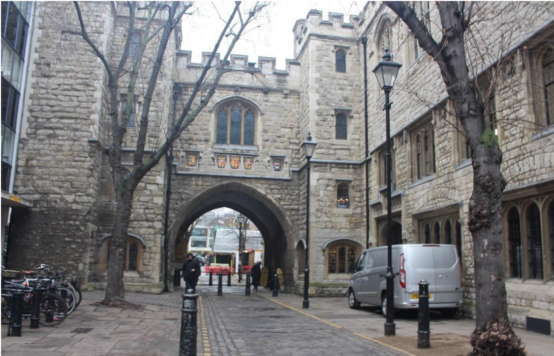
St John's Gate where the Museum is housed. The entrance is under the Gate.

St John's Gate, St John's Lane Clerkenwell London EC1M 4DA