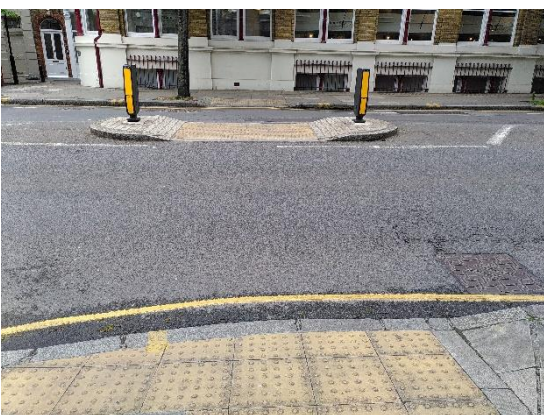
Clerkenwell Road has a pedestrian crossing with dropped kerbs and a refuge island.