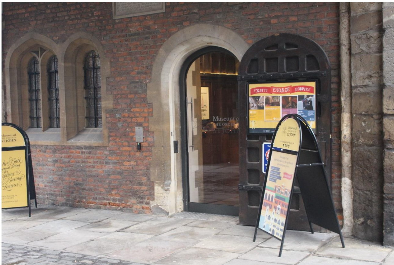
The main entrance to the Museum at St John's Gate.