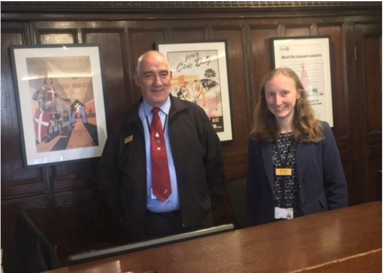
The Museum reception