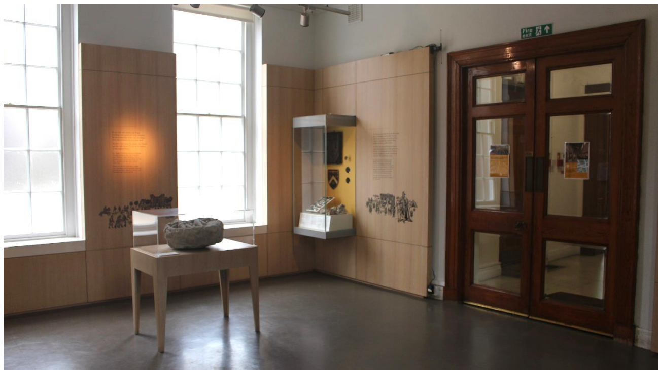
The Priory Gallery