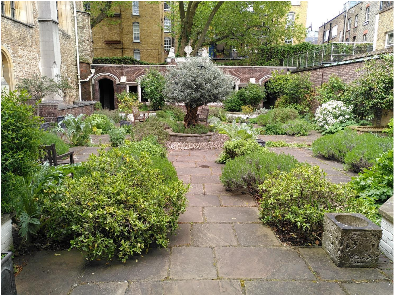
The Cloister Garden