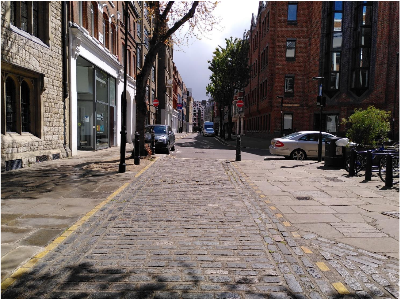
The south side of St John's Gate