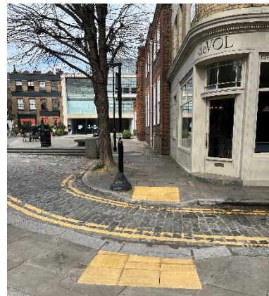
There is a dropped kerb for the crossing over Albemarle Way.