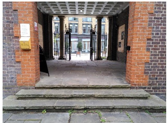
There are three descending steps into the Cloister Garden. There are no handrails.