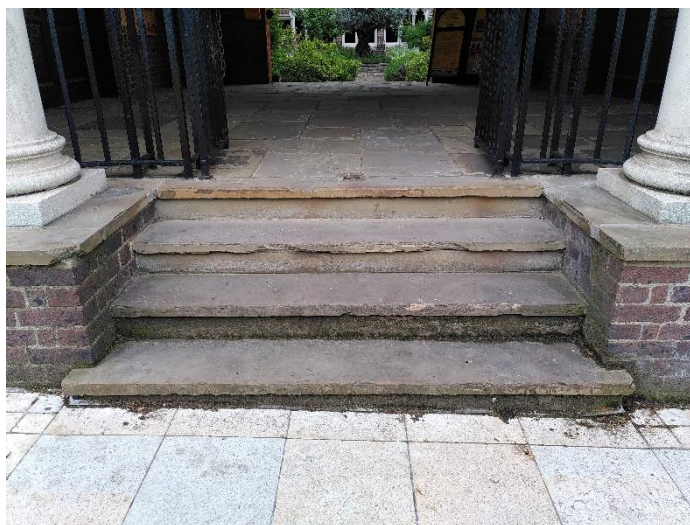
From St John's Square to the Priory Gallery there are four ascending steps. There are no handrails.