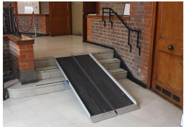
From the Church foyer into the Church, there are 3 steps. A permanent handrail is available on the right as you ascend.